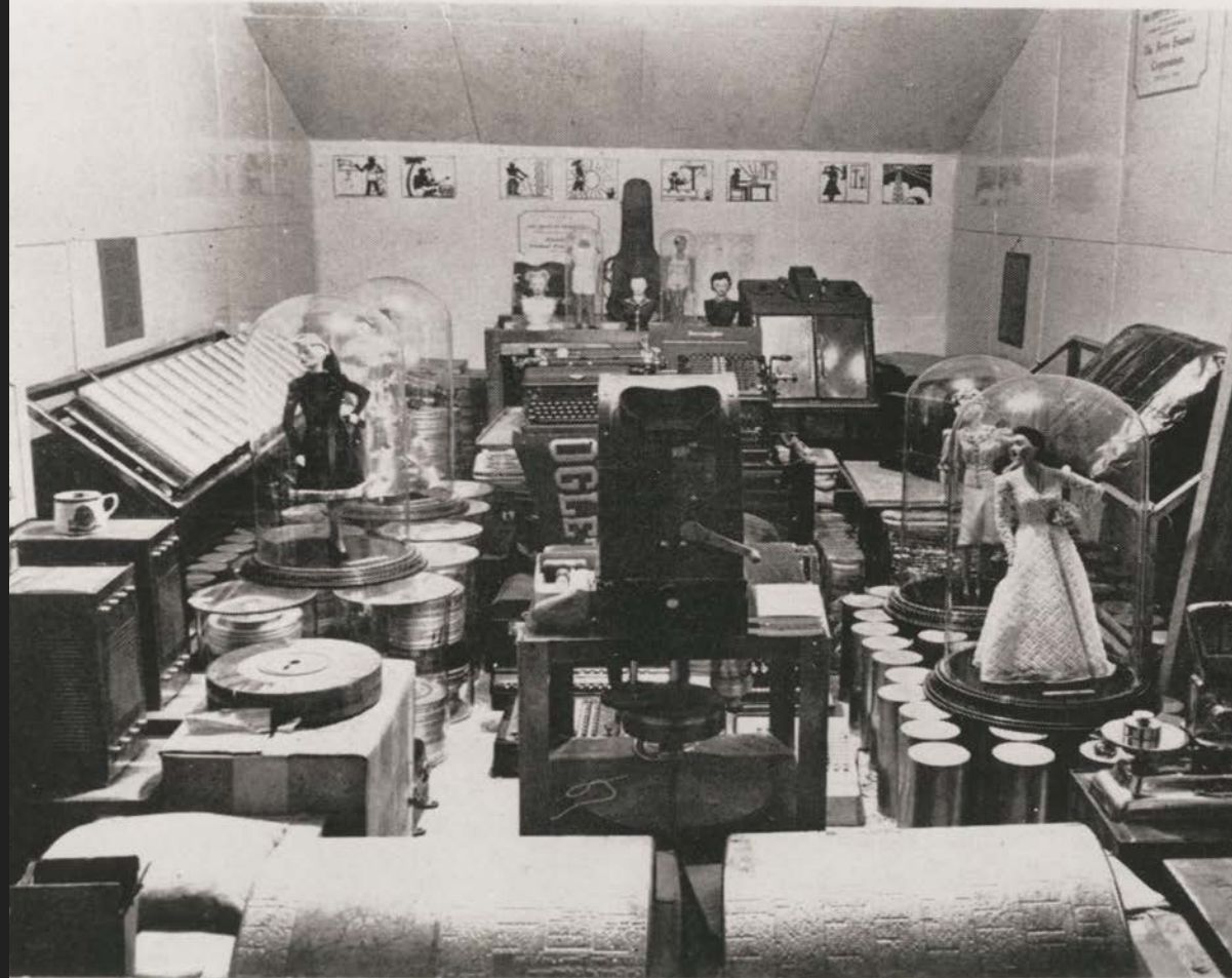
VIEW OF THE INTERIOR OF THE CRYPT OF CIVILIZATION—